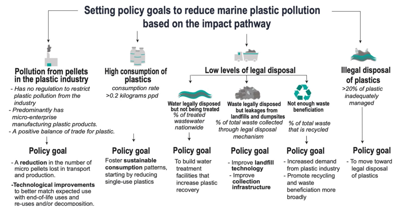
Fig. 2. Identifying policy entry points and setting policy goals.