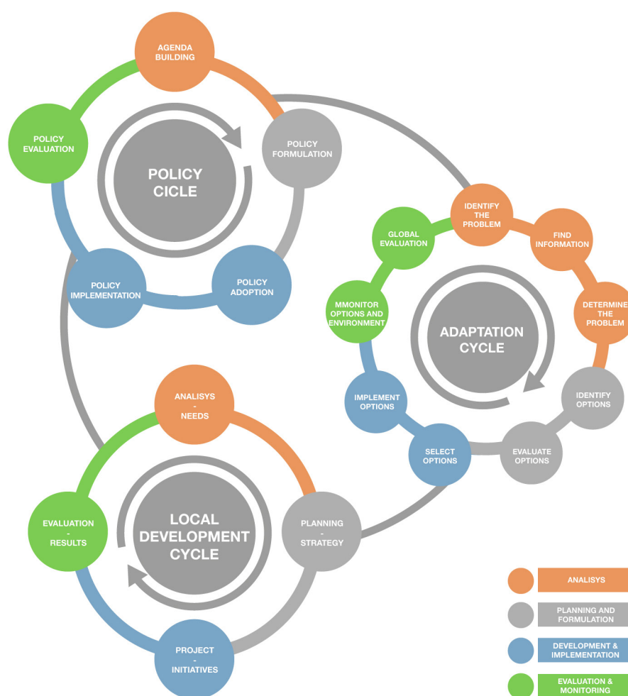
Figure 3. Interaction between the processes of local development, adaptation and public policies. In ALD, the phases of Analysis, Planning and formulation, Development and implementation, Evaluation and monitoring are binding between them (11, 12).

Adaptive local development promotes a paradigm of sustainable development with special focus on risk management, resilience and adaptation. The processes of local development, public policies and adaptation to climate change have phases that are compatible and related, although their scales and temporalities are different and depend on factors specific to each territory. We can link these processes through the following phases: 1) analysis 2) planning / formulation 3) development and implementation 4) monitoring and evaluation (Figure 3), and within this framework propose recommendations for an effective ALD.