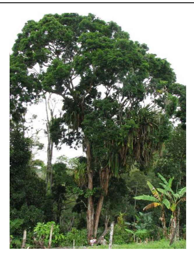
Fig. 4 Brazil wood tree ( Caesalpinia echinata ) with high density of epiphytes in a cabruca in the region of Ilhéus where cabrucas represent most of the tree cover in the landscape