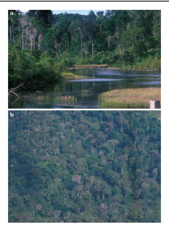
Fig. 2 Traditional cabrucas of southern Bahia, Brazil, retain much of the original forest structure. a Cabruca in the county of Una; b Aerial view of a cabruca in the same region