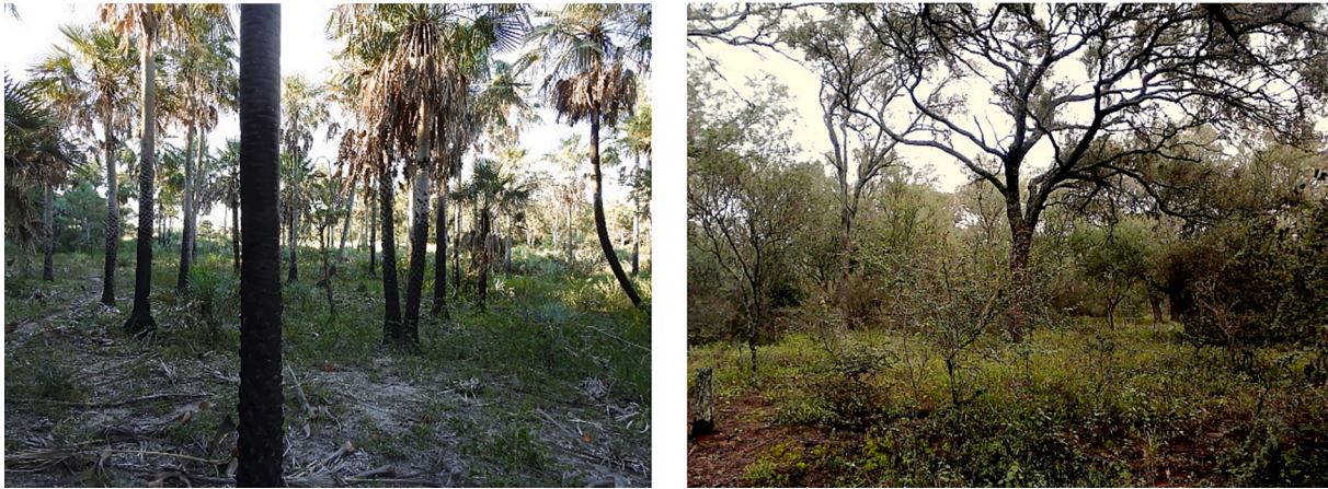
Fig 2. Representative formations of the Humid Chaco ecosystem (left), with the palm Copernicia alba dominating the tree stratum, and the dry Chaco (right) with Schinopsis lorentzii (large tree in the centre of the photograph).

systems and countries. Therefore, there is a knowledge gap that should be identified for a complete overview of the regional context.